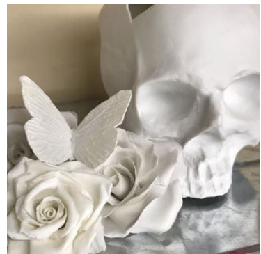
Top five images - Mega Mouths - ASP Wednesday Night class show.