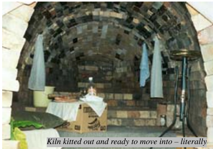
Kiln kitted out and ready to move into – literally