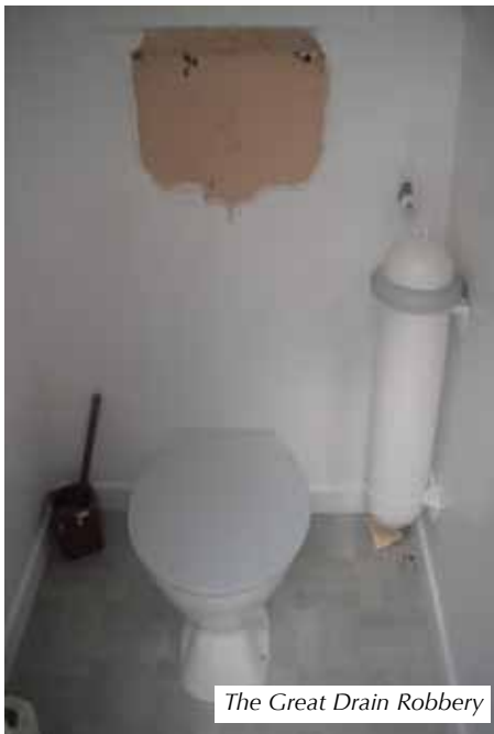
The Great Drain Robbery