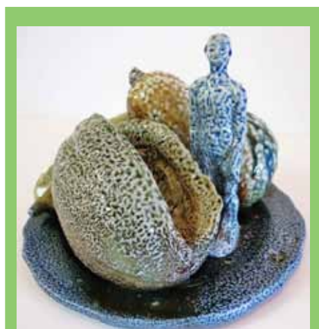
"Still life with boy, melon, aubergine and butternut"

This particular kiln is a 30cuft gas. It has had hundreds of firings since I purchased it new in 1996. Without warning the hose exploded at the junction where it attaches to the kiln and caught fire. Fortunately I was nearby and was able to immediately turn off the gas and extinguish the flames. Had I been some distance away the workshop could have been destroyed. There was nothing visible to indicate anything was amiss. I would recommend any one using a gas kiln to check that their regulator is functioning correctly and check the condition of the hose where it attaches to the kiln. Possibly shorten it by 2.5cm in case of hidden corrosion.